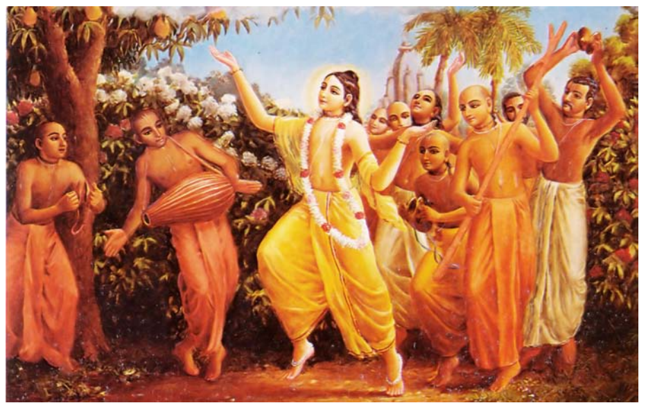
Lord Chaitanya Mahaprabhu, Golden Avatar of Radha Krishna and founder of Hare Krishna Movement

shekhara cid-ananda-deha: He is just like a fresh boy, and His body is transcendental, spiritual, full of bliss. Sarvashraya: He is the resting place of everything. He is the Supreme Lord. This is the description of Krishna.